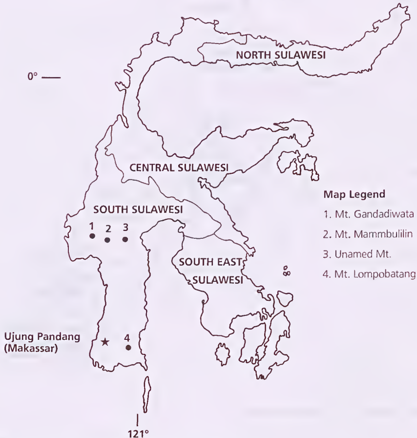
Fig. 4. Begonia exploration sites in Sulawesi, Indonesia.

Field observation on Begonia in lower montane forests of Indonesia and Papua New Guinea indicate species prefer stream margin habitats. And the steep, rocky embankments directly above streams are the habitats preferred over forest slope areas or mountain ridges. When undertaking field expeditions to collect Begonia , the decision was made to search out streams along elevational gradients. Stream margins are subject to regular disturbances caused by rise and fall of water level in the stream.